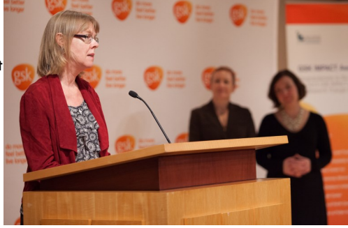
Accepting the GSK Impact Award (11/15)